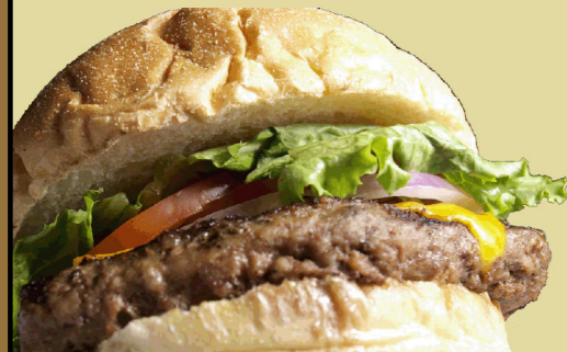
shown with American cheese and optional Lettuce, tomato and onion

Black & Blue Burger Our own blackening spice and bleu cheese crumbles served on a toasted kaiser roll 9.99